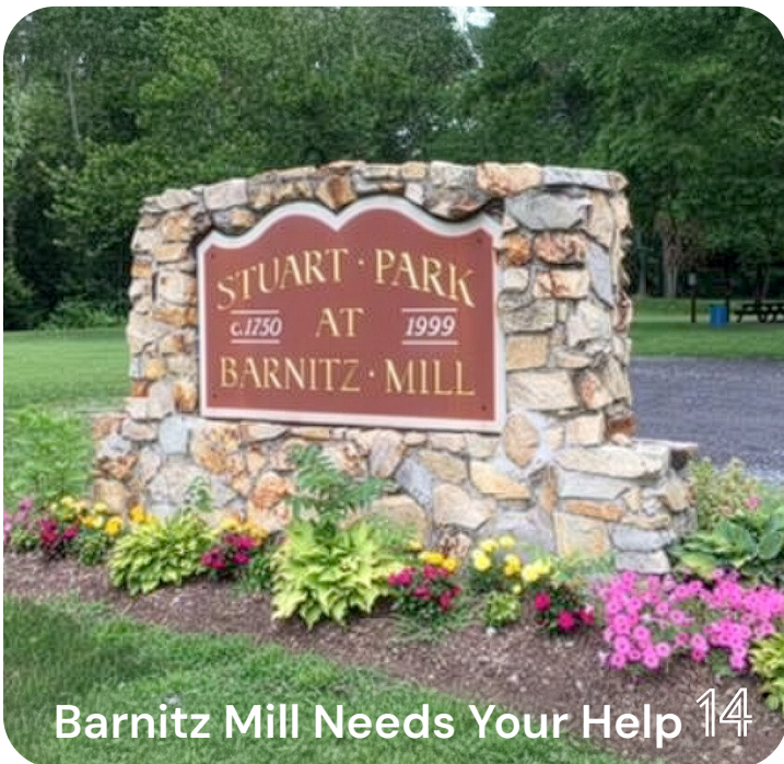
Barnitz Mill Needs Your Help 14