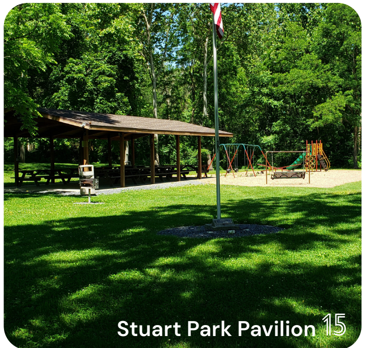
Stuart Park Pavilion 15