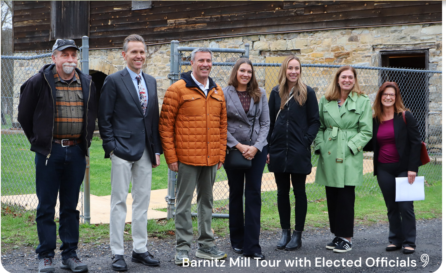
Barnitz Mill Tour with Elected Officials 9