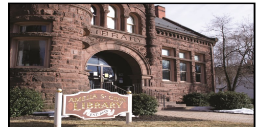
The Amelia S. Givin Library 114 N Baltimore Avenue Mt. Holly Springs, PA 17065