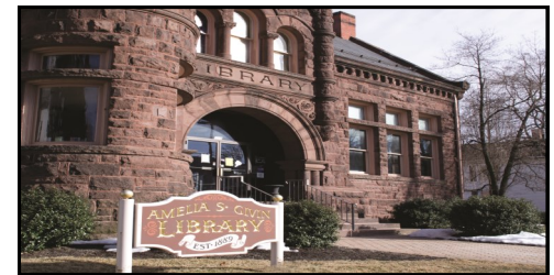
The Amelia S. Givin Library 114 N Baltimore Avenue Mt. Holly Springs, PA 17065